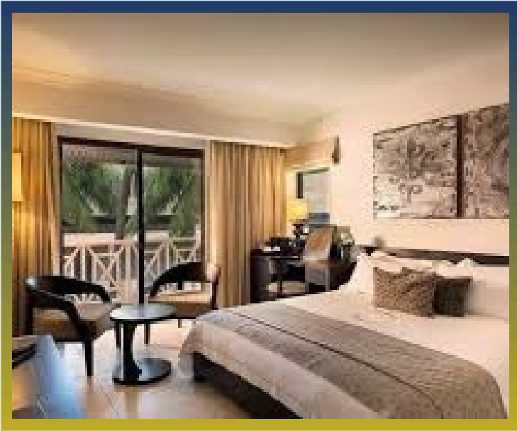
Junior Suite Partial Ocean View